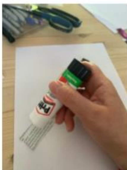
Put glue on the back of one strip