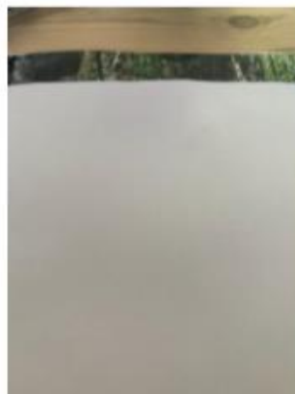
Place on top of a plain piece of paper