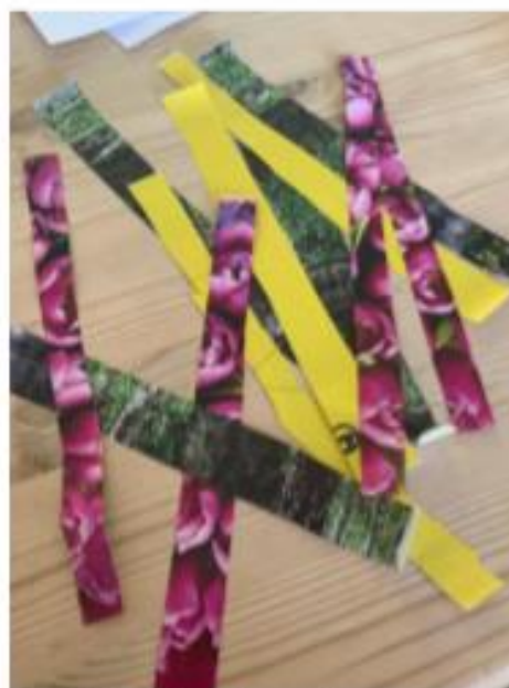
Cut strips from the paper